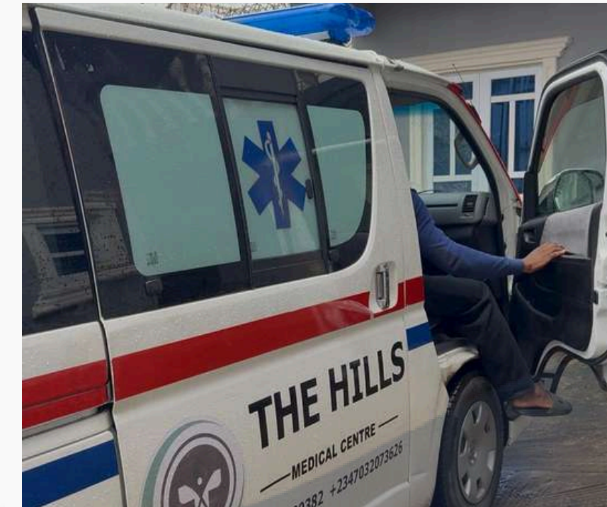
Renovation and Digitizing, 15-Bed Hospital Benin